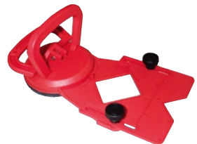
Diamond Tile Bits